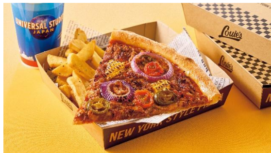
Pulled Pork & Chicken Spicy BBQ Pizza Set Available at: Louie’s N.Y. Pizza Parlor