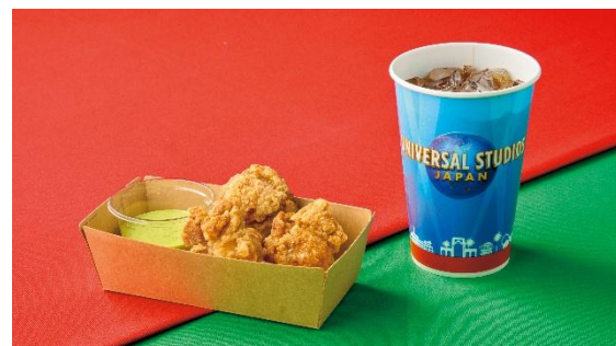
<Annual Pass Exclusive Value Set Menu> Basil Mayo Chicken, served with an alcoholic beverage or soft drink (R) Available at: Louie’s N.Y. Pizza Parlor *Available starting at 4:00 PM

Scheduled release date: Monday, June 29, 2026