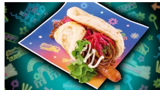
Curry Naan!?! Yakisoba Dog Available at: Hot Dog Cart inside Universal Market