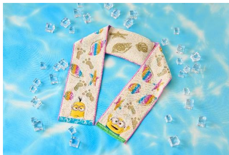
Neck Towel with Cooling Pack Available at: Minion Market Place, etc.

Scheduled release date: Monday, June 29, 2026