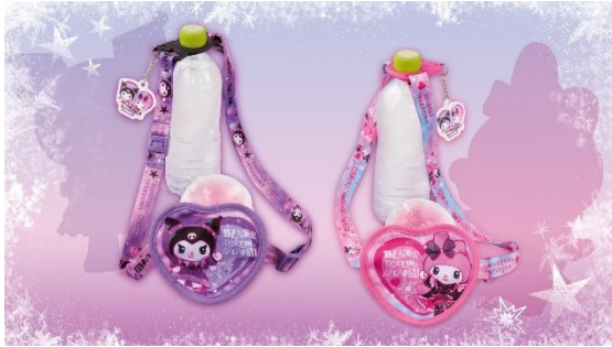
Left: Kuromi Bottle Strap with Ice Pack Right: My Melody Bottle Strap with Ice Pack Available at: Food carts next to the Illumination Theater entrance, etc.

Enjoy a refreshing summer filled with festive fun, featuring cool sweets and drinks served alongside popular characters at the Park like My Melody, Kuromi, and the Minions as well as cooling items to help you beat the heat.