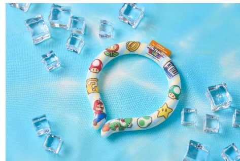
Cool Neck Ring Available at: One-Up Factory™, etc.

*Please note that the menu, product designs, participating stores, and launch dates are subject to change without notice. *We apologize for any sold-out items. *Please note that some stores may be closed depending on weather conditions or the time of day.