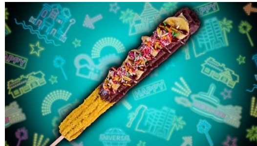
Super!! Chocolate Banana Churritos Available at: Happiness Wagon inside Universal Market