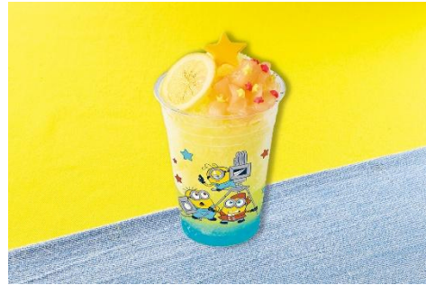
Movie Star Minion Frappé: Peach & Lemon Available at: Delicious Me! The Cookie Kitchen

Scheduled release date: Monday, June 29, 2026