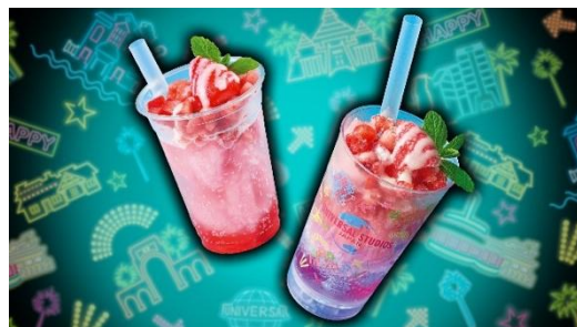
Left: Strawberry Milk Cream Soda Smoothie Right: Strawberry Milk Cream Soda Smoothie (with neon cup) Available at: Trolley Treat inside Universal Market