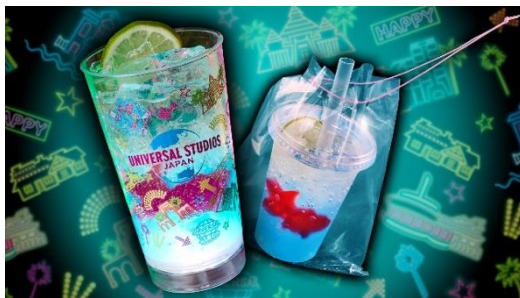
Left: Summer Festival Goldfish Lemon Soda (with neon cup) Right: Summer Festival Goldfish Lemon Soda Available at: Happiness Wagon inside Universal Market

What’s more, yakisoba—a summer festival food staple—has been transformed into a one-handed snack called the “Curry Naan!?” Yakisoba Dog,” featuring the same toppings of pickled red ginger and mayonnaise but paired with a curry-flavored naan. New additions include the “Strawberry Milk Cream Soda Smoothie” where you can enjoy the swirls of strawberry shaved ice and soda, as well as “Candied Apple: Apple Mousse” and “Water Balloon: Peach Jelly & Rare Cheese Mousse”, which transform memories of street food stalls into sweet treats. Glow sticks, an essential part of the “NO LIMIT! Glow Up Oh! Matsuri”, will also be available. Enjoy an even more exhilarating experience as you become one with the performers with a glowing penlight in hand. Enjoy an exciting “Night Festival” to the fullest and celebrate the Park’s 25 th anniversary this summer featuring “Summer Festival” food and merchandise that are bursting with festive spirit in both appearance and taste.