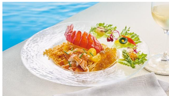
Chilled Lobster Pasta with American Sauce Granita Available at: Parkside Grille *Available from opening until 3:00 PM