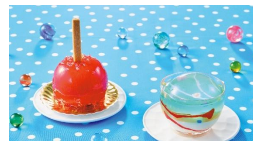
Left: Candy Apple: Apple Mousse Right: Water Balloon: Peach Jelly & Rare Cheese Mousse Available at: Beverly Hills Boulangerie