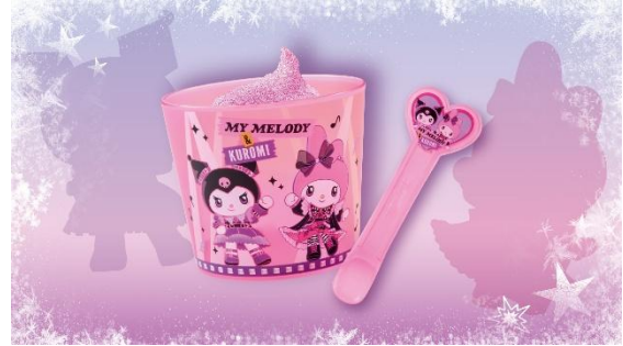
Soft-Serve Grape My Melody & Kuromi (Includes Bucket & Spoon) Location: Food cart next to the entrance to the Illumination Theater