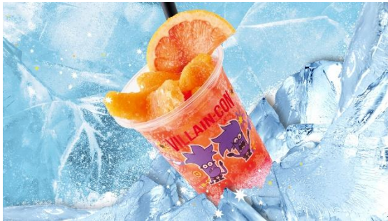
Crush! Villain's Blood Orange Frozen Soda Available at: Evil Eats