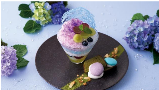
Hydrangea: Japanese-style Grape & Yuzu Sorbet with Baked Sweets Available at: SAIDO

After enjoying the Park to the fullest, take a break at a cool restaurant. At “SAIDO,” the Park’s only Japanese restaurant, a summer-limited Japanese dessert inspired by a hydrangea garden, whose color changes when drizzled with grape syrup, is now available. Relax and unwind in the restaurant’s serene atmosphere. And the Park Side Grille is introducing its new “Chilled Lobster Pasta with American Sauce Granita,” featuring a refreshingly cold granita-style sauce. We also have summer-friendly menu items available at “Louie’s N.Y. Pizza Parlor” and “Mel’s Drive-In”. Enjoy a refreshing atmosphere and limited-edition culinary delights even on hot summer days at the Park. We’ll also be offering special set menus available only at night for annual pass holders, as well as special dishes to satisfy your appetite in the evening. Details will be announced at a later date.