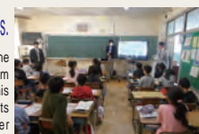
Conducting delivery of inquiry-based learning (limited number of schools)

We will launch a new inquiry-based learning program, created in accordance with the Ministry of Education, Culture, Sports, Science and Technology's curriculum guidelines, to go beyond the traditional framework of social studies field trips. This program aims to expand elementary school students' understanding of the threats posed by natural disasters and to promote the personalization of disaster preparedness.