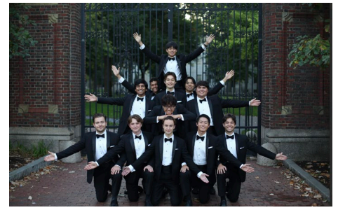
The Harvard Krokodiloes of 2025

Comprised of twelve tuxedo-clad Harvard undergraduates, the Harvard Krokodiloes have been charming audiences across the world since 1946 with their signature blend of jazz, funk, rock and roll, and ballad arrangements. Their musical excellence, witty humor, professionalism, and intricate choreography have made them instant crowd-pleasers and earned them invitations to perform in more than 60 countries. Every year, the Kroks embark on 80 days of international tour to around 20 countries, performing for esteemed audiences including President Bill Clinton, King Bhumibol of Thailand, and President Mukherjee of India. From Cambridge to Cape Town, in public concerts or private performances, the Krokodiloes promise an a cappella experience like no other.