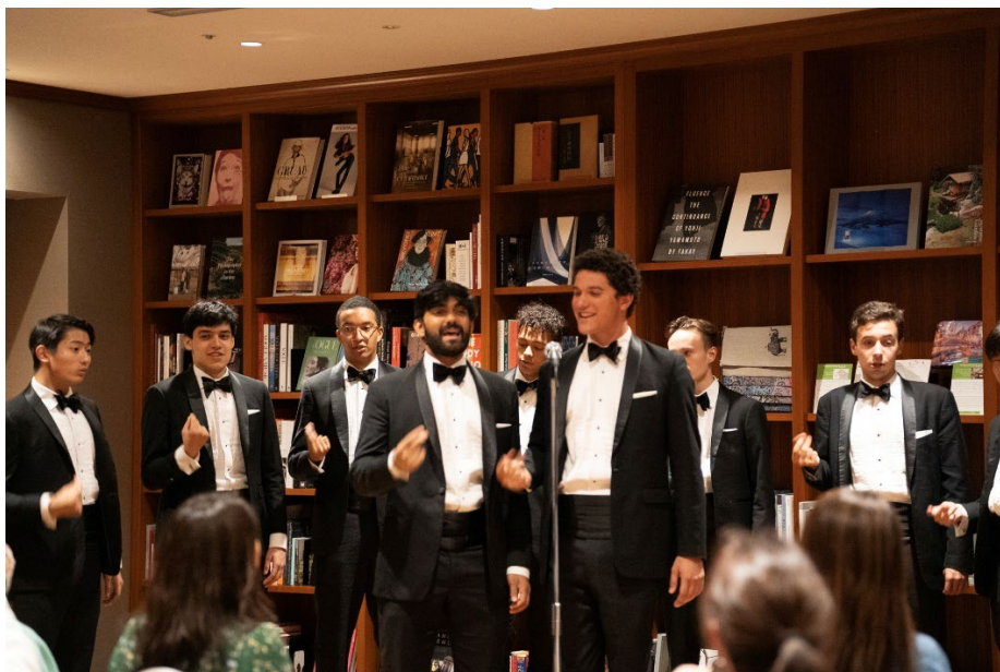
Captivating melodies by The Harvard Krokodiloes at Shiba Park Hotel, 2024

Join us for an exclusive evening where music inspires, tradition thrives, and generosity makes a difference.