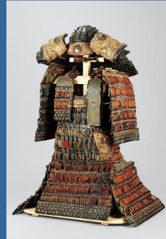
National Treasure: Red “yoroi” armor with “kawaodoshi” (plates bound together with leather laces). Heian Period, 12th century / Collection of the Okayama Prefectural Museum. Display period: May 20 – June 15.

Celebrate Japanese heritage at the Osaka City Museum of Fine Arts with the Special Exhibition: National Treasures of JAPAN. From April 26 to June 15, this remarkable event marks the Osaka-Kansai Expo and the grand reopening of the museum following a two-and-a-half-year-long renovation. Featuring approximately 130 National Treasures, the exhibition provides a rare chance to explore the pinnacle of Japanese art and craftsmanship. Visitors will be captivated by the exhibit’s six major themes, including the “Masters of Japanese Art” section, featuring works by renowned Japanese artists of the past, and “The Splendor of Ancient Japan” section, which explores ancient Japanese culture through art pieces such as dogū clay figurines, dyed textiles, and more. Visitors with reservations get priority entrance on weekends and holidays, so it is recommended to make a prior reservation.