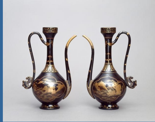
Pair of Ewers with Landscapes Japan, Edo period, 18th century Kyoto National Museum

For over two millennia, Japan has engaged with various cultures around the world, and these encounters have been vividly reflected in the country’s art. The special exhibition “ Japan, an Artistic Melting Pot ” offers a fresh perspective on the history of Japanese art through the lens of international cultural exchange. Held at the Kyoto National Museum, just a 25-minute walk from Kyoto Station, the exhibition features approximately 200 works—including 18 National Treasures—encompassing paintings, sculptures, calligraphy, works of decorative and applied art from ancient times to the modern era. Highlights include iconic masterpieces such as the woodblock print “ Under the Wave off Kanagawa ,” also known as “ The Great Wave ,” from the series “ Thirty-six Views of Mount Fuji ” by Katsushika Hokusai, and Tawaraya Sōtatsu’s golden National Treasure screens “ Wind God and Thunder God ”. These artworks trace how Japanese culture has been shaped by encounters with different cultures across thousands of years of history. Timed to coincide with Expo 2025 Osaka, Kansai—a global celebration of cultural exchange—this exhibition offers a unique opportunity to explore the rich relationship between Japanese art and the world. JAPAN, an Artistic Melting Pot