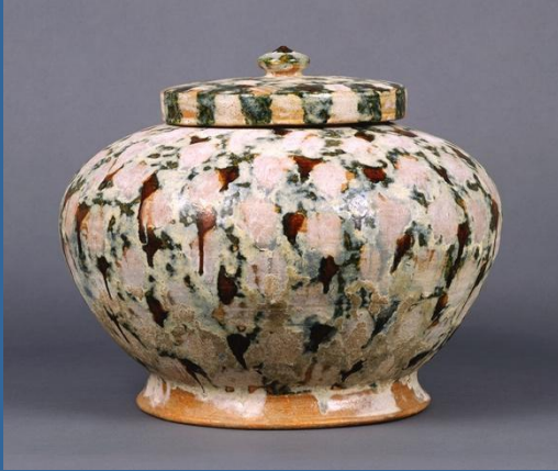
Important Cultural Property, Funerary Jar Excavated from Nagoso Tomb, Hashimoto, Wakayama Japan, Nara period, 8th century, Kyoto National Museum