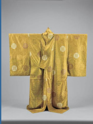
National Treasure: “Akome” (a layer of clothing worn by nobles between the “shitagasane” underkimono and “hitoe” robe), featuring a light green pattern of small hollyhock leaves and round crests, woven in double-layered twill (part of the ancient Shinto treasures). Nanbokucho Period, Meitoku 1 (1390) / Stored at Kumano Hayatama Taisha Shrine, Wakayama. Display period: May 27 – June 15.