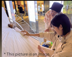
* This picture is an image.

Each session will cover the same content and last approximately 45 minutes. Limited to around 12 participants per session