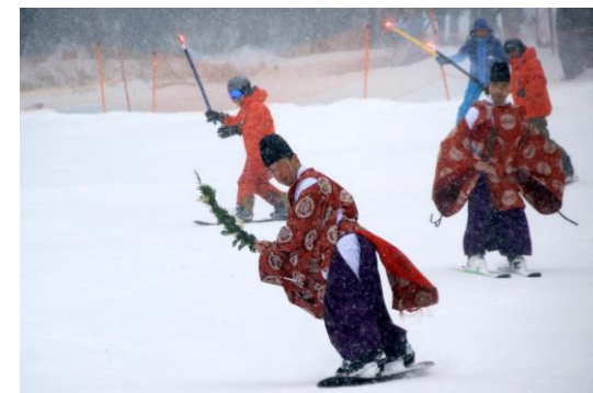
Ski resort opening (at NIKKO YUMOTO-ONSEN SKI PARK)

At noon on December 25th, the Konsei Road on National Route 120 was closed for the winter.