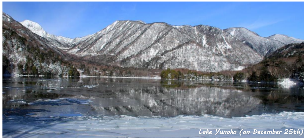
Lake Yunoko (on December 25th)

Vol. 115 DEC 26th, 2024 Nikko City Tourism Association https://www.visitnikko.jp/en/