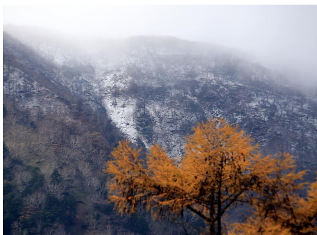
At Yumoto area (on November 6th)