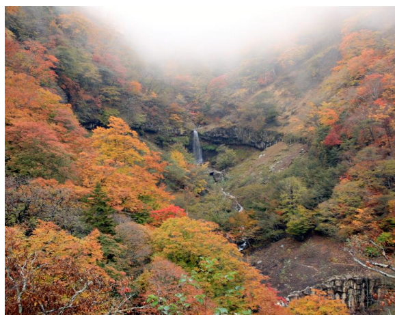
Hannya Falls at First Iroha Slope (on November 6th)