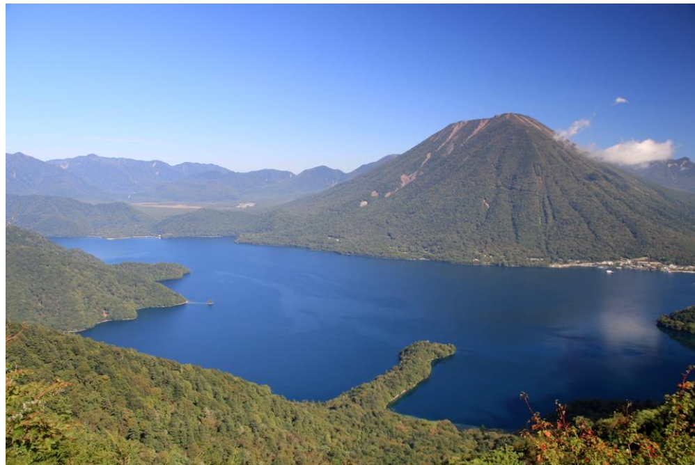
View of Okunikko (From Mount Hangetsu Observation deck)

Vol. 108 OCT 5th, 2024 Nikko City Tourism Association https://www.visitnikko.jp/en/