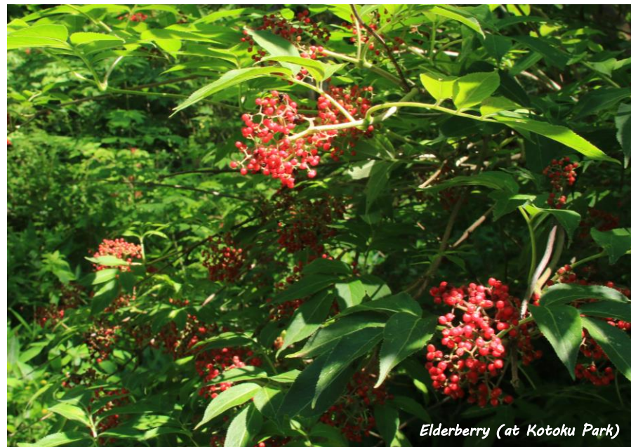
Elderberry (at Kotoku Park)