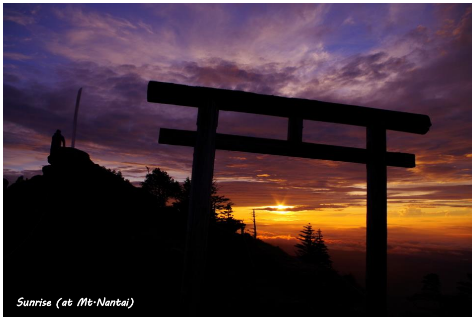
Sunrise (at Mt. Nantai)

Vol. 104 JULY 27th, 2024 Nikko City Tourism Association https://www.visitnikko.jp/en/