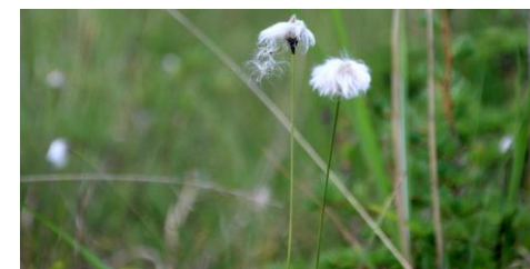
Cotton glass in Senjugahara Marshland