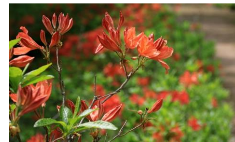
Rhododendron japonicum in Yumoto Onsen