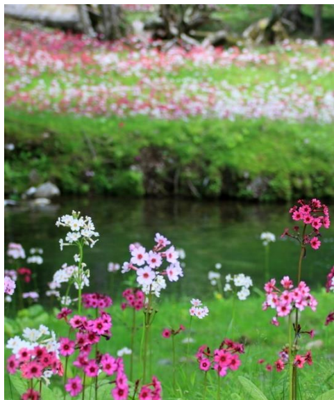
Primula japonica at Senjugahama Beach

Vol. 99 JUNE 13th, 2024 Nikko City Tourism Association https://www.visitnikko.jp/en/