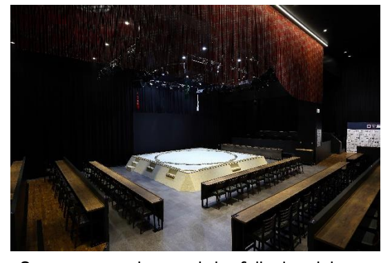
Seats arranged around the full-size dohyo stage in a theater-style layout, ensuring excellent visibility from every seat.