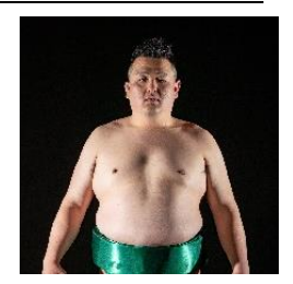
MATSU Height: 5' 1" Weight: 265 lbs