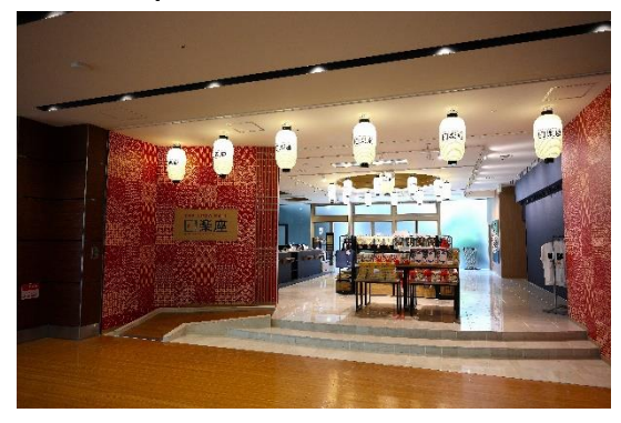
Offering HIRAKUZA original products, popular sumo merchandise, and Japanese souvenirs for inbound tourists.