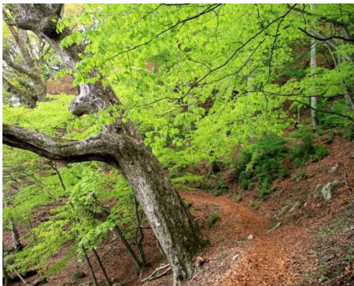
Fresh green (at Lake Chuzenji north shore)

Vol. 95 MAY 18th 2024 Nikko City Tourism Association https://www.visitnikko.jp/en/