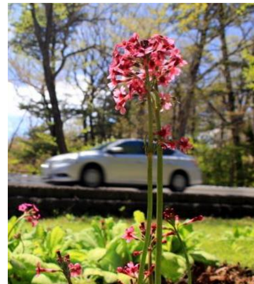
Primula japonica (at Shobugahama Beach)