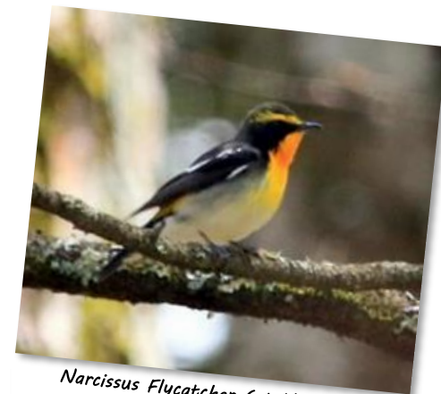
Narcissus Flycatcher (at Yudaki Falls)

Fallen rocks had blocked the trail near Senjugahama Beach, but a detour was set up in the morning of May 15th, making it passable.