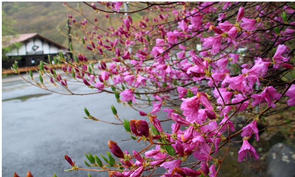
Togoku mitauba tsutsuji (Rhododendron wadanum) at Lake Chuzenji

Vol. 94 MAY 11th 2024 Nikko City Tourism Association https://www.visitnikko.jp/en/