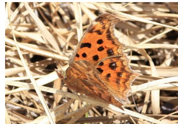
Polygonia c-aureum (Senjogahara Marshrland)

Konsei Road and Sanno Forest Road will release their winter-lockout at 12:00 noon on April 25th.