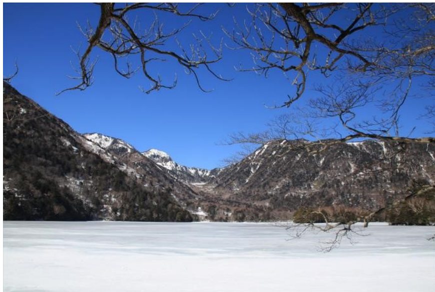
Snow on Loose Ice (Lake Yunoko)

Vol. 89 FEB 17th 2024 Nikko City Tourism Association https://www.visitnikko.jp/en/