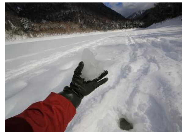
Sherbet-like Ice on Lake Karikomi

Lake Chuzenji and Kegon Falls also have low water volume due to the warm sunny weather.