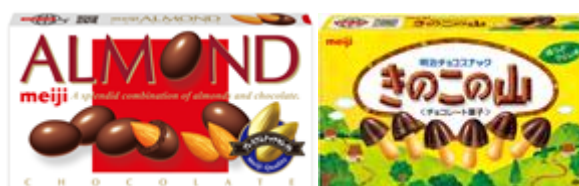
Brand link product image