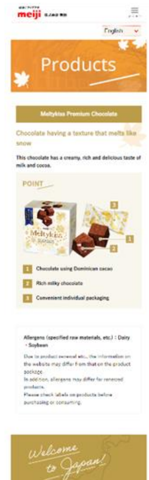
Multilingual product information website image