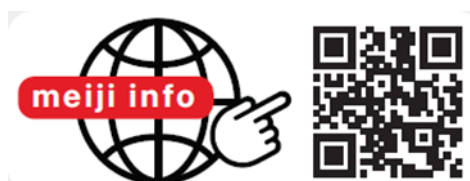
Brand link image

Printing two-dimensional barcode and search logo (Brand Link) on the packages of over 100 snacks and confections