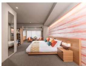
Guest Room (4 people capacity)