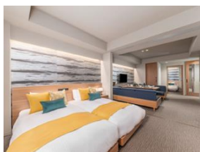
Guest Room (6 people capacity)