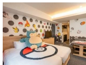
Pokémon Room (Image)