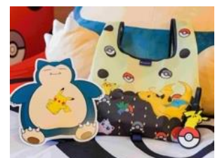
Pokémon Room Original Novelties (Kansai Design)

The guest rooms feature a soft design to express the subtle changes in each season's colors reflected by the Kamo River. You can choose from a wide variety of room types, including the main 40 m 2 rooms, two-bedroom and connecting rooms, Pokémon rooms, and more. The Pokémon rooms, which are popular with Pokémon fans around the world, not only greet you with a giant Snorlax sitting on a bed, but are also stocked with plates and cups with an original design and come with a present of Pokémon room original goods (reusable bag, luggage tag, and message card).