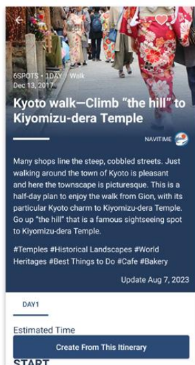
Create and share itineraries