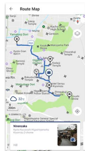
Automatic route search