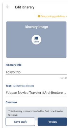
Save and edit itineraries