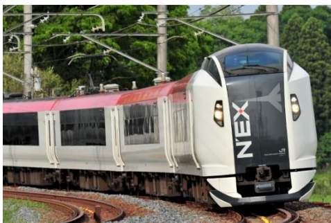
【Limited express Narita Express (E259)】