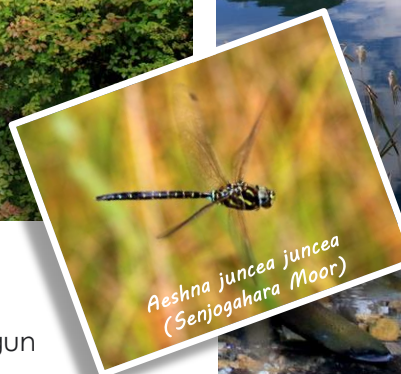
Aeshna juncea juncea (Senjogahara Moor)