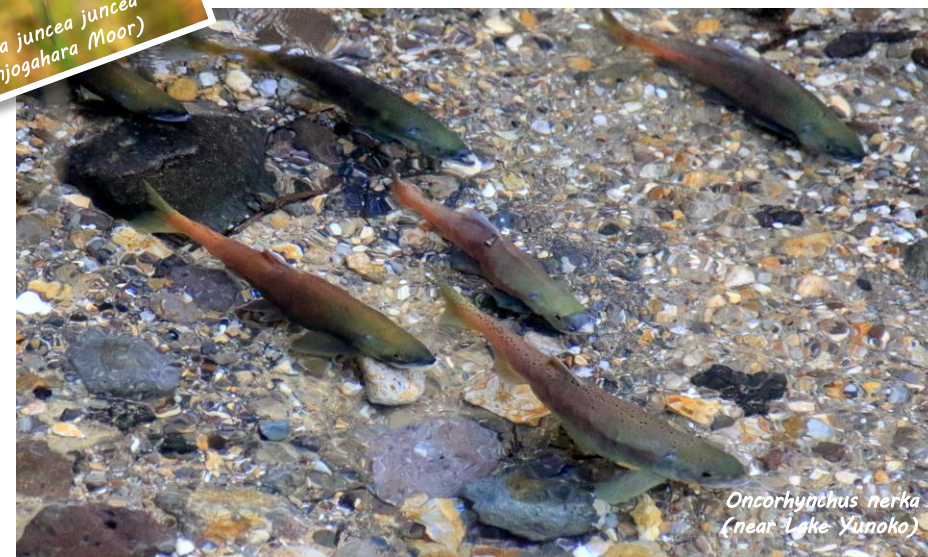
Oncorhynchus nerka (near Lake Yunoko)

I encountered a group of elderly women who were unable to move due to exhaustion at the bottom of Sanno Pass. Rescue often occurs due to fatigue. Please prepare a reasonable hiking plan.