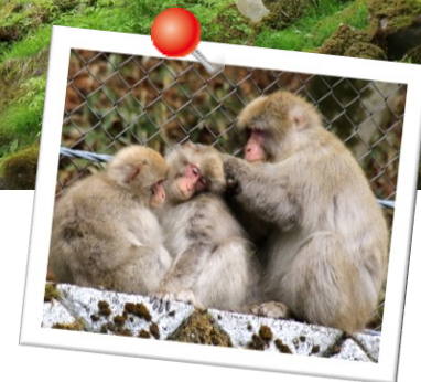
Japanese monkeys (at Utagahama Beach)