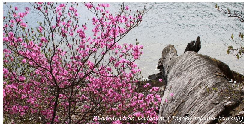
Rhododendron wadanum (Togoku-mitsuba-tsutsuji)

Vol. 37 May 14th, 2022 Nikko City Tourism Association https://www.visitnikko.jp/en/