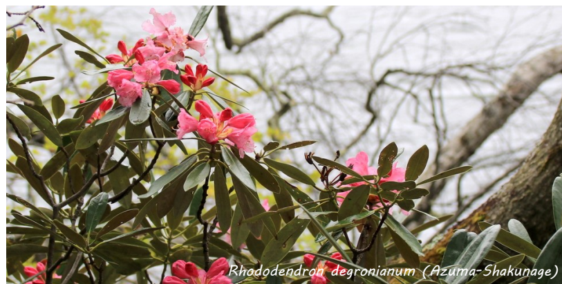
Rhododendron degronianum (Azuma-Shakunage)