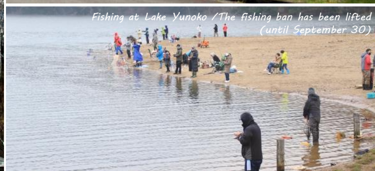
Fishing at Lake Yunoko /The fishing ban has been lifted (until September 30)