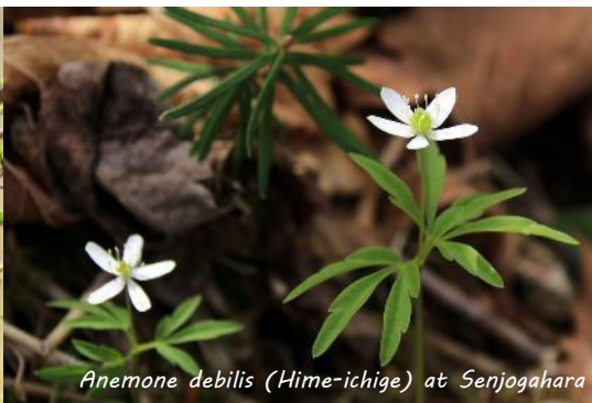
Anemone debilis (Hime-ichige) at Senjogahara