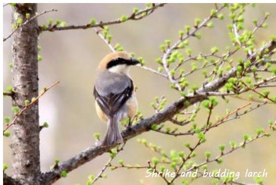
Shrike and budding larch

We will introduce you to the beautiful nature in Okunikko. Listening birds chirping, take a deep breath in forest...They will give you a comfortable time.