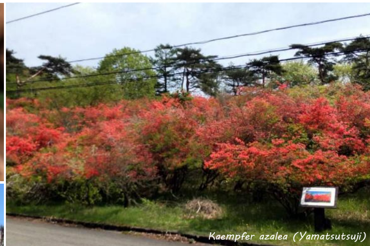
Kaempfer azalea (Yamatsutsuji)