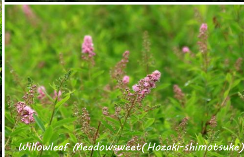
Willowleaf (Meadowsweet) (Hozaki-shimotsuke)