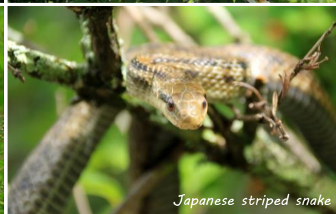
Japanese striped snake

In Okunikko, it is still rainy days. When I stopped by Loridaki fall, a river appeared in a place that was supposed to dry up in summer.