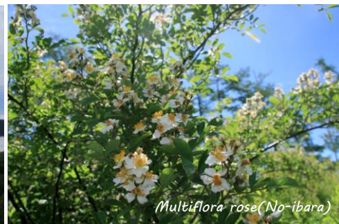
Multiflora rose (No-ibara)