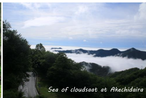
Sea of clouds at Akechidaira