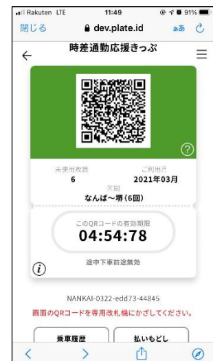
Screen for entry