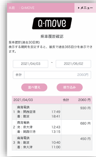
History reference page