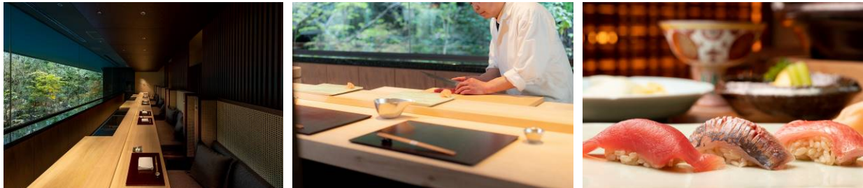
Restaurant Umi no Yuha

For the restaurant, a sushi eatery has been established, a first for the FUFU series. Named Umi no Yuha, this restaurant serves dishes prepared using locally caught seafood such as jikinme , a high-grade sea bream, found around the Izu Peninsula. The counter with high-back chairs seats 10 people, and guests can enjoy their meal in an enveloped space providing a sense of privacy. There are also two private rooms with counters that can accommodate up to four people.