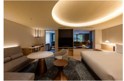
Stylish Suite Double