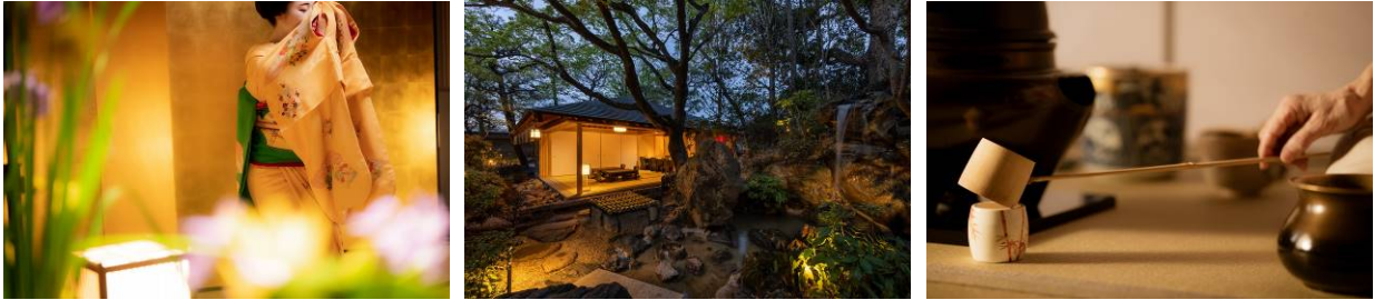
Japanese architecture Hanare Yae-Hitoe

In addition, there is a Japanese garden within the site that has been carefully preserved from before the construction and in the corner of which is a detached room of traditional architecture that can be used as a bar with a traditional Japanese atmosphere or for geisha and maiko dancing or even for flower arrangement, tea, and incense-smelling ceremonies.