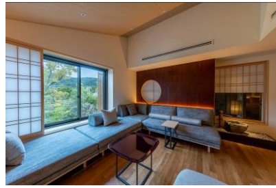
FUFU Luxury Suite