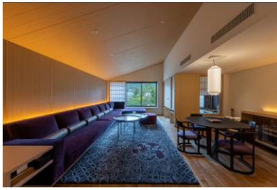
FUFU Luxury Premium Suite