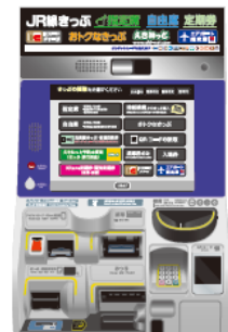
↑ Reserved seat ticket vending machine

Sapporo(※)・Soen(※)・Kotoni・Teine(※)・Otaru(※)・Naebo(※) Shiroishi(※)・Shin-Sapporo(※)・Kita-Hiroshima(※)・Shimamatsu(※) Chitose(※)・Minami-Chitose(※)・New Chitose Airport(※)・Iwamizawa(※) Tomakomai(※)・Shiraoi・Higashi-Muroran(※)・Datemombetsu(※)・Toya(※) Noboribetsu(※)・Shinkawa(※)・Hachiken(※)・Ainosato-Kyoikudai(※) Asahikawa・Nayoro・Wakkanai・Engaru・Kitami・Abashiri Shintoku・Obihiro・Kushiro Shin-Hakodate-Hokuto・Hakodate・Goryokaku・Kikonai・Okutsugaru-Imabetsu