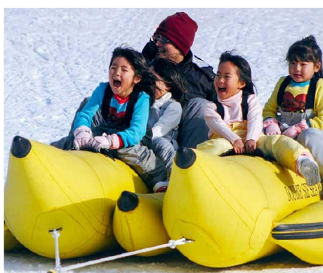
Banana boat rafting is one of several fun activities to try in the snow.