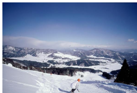
Visitors can enjoy skiing & snowboarding at all 3 resorts.

Our website has detailed information about ski courses, rental costs, snow activities, transportation, and more in English , Traditional Chinese , and Thai .