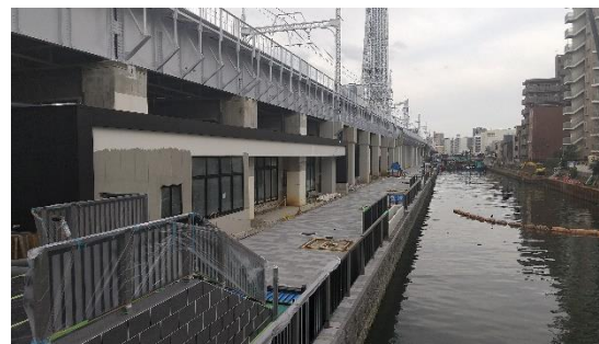
△ The construction underway (left: Sumida Park; right: Shinsui Terrace)