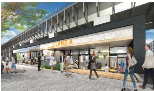
△ LAND_A (conceptual image)

On April 13, Tobu Railway and Sumida Ward will hold a SUMIDA RIVER WALK and Kitajukken River/Sumida Park Area Opening Ceremony to celebrate the new area through cooperation between public and private sectors. Tobu Railway will strive continuously to make the area the leading tourist location in Tokyo while cooperating in the Kitajukken River and Sumida Park Circular Sightseeing Path development project promoted by Sumida Ward. Further details are provided in the attachment.