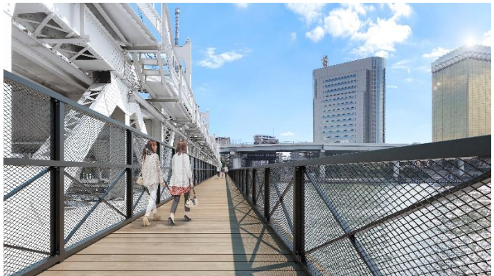
SUMIDA RIVER WALK (conceptual image)