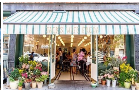
△ Jack's Wife Freda (conceptual image)