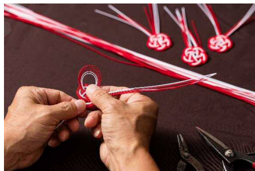
Making mizuhiki (illustration purpose)