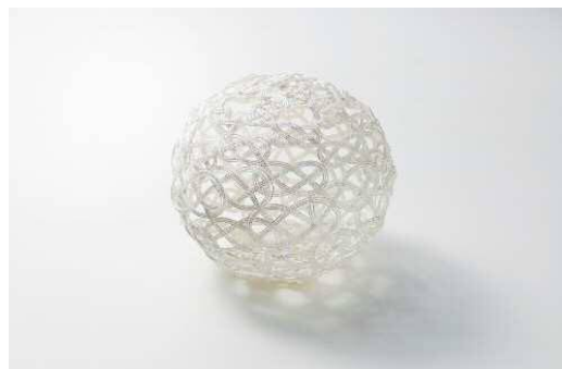
Mizuhiki as Christmas tree decoration (illustration purpose)

*The images are illustration purpose only. They may be different from actual mizuhiki decoration being used for the Christmas tree.