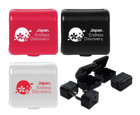
JNTO Travel Adaptor

Exclusive gift redemption at the Japan Pavilion – 6H41, valid with purchases of group tours, free and easy packages or returned air tickets to Japan at the three-day travel event. The special gift available will be an Exclusive JNTO Travel Adaptor. Also, visitors who complete a short survey will receive a pair of JNTO Exclusive Chopsticks (Made in Japan).