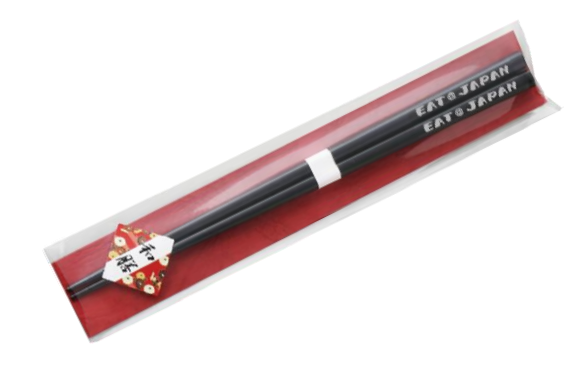
JNTO Chopsticks Set